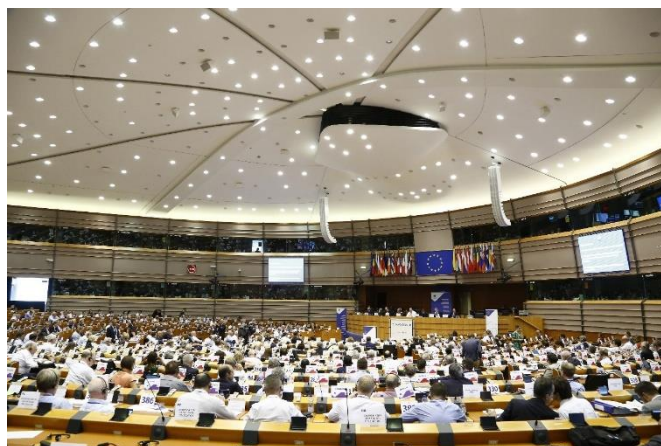
A Plenary meeting

Before each Plenary session, a PES Group meeting is held (normally between 10:30 a.m. and 1:00 p.m.) with the aim of establishing common positions on key political issues, and thus of presenting, as far as possible, a cohesive line for voting in the Plenary session. The PES Group meetings also provide the opportunity to hold internal group discussions and to debate with external guest speakers from other EU institutions or the wider political family.