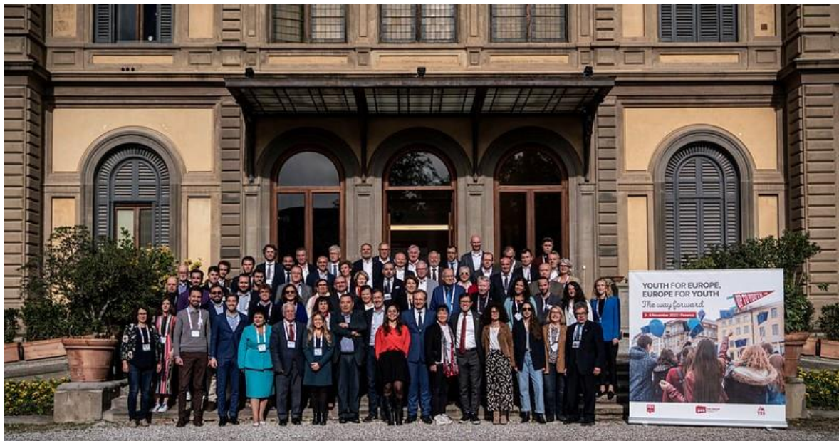
The PES Group members at the Extraordinary PES Group meeting in Florence in November 2022 for a Europe for youth.