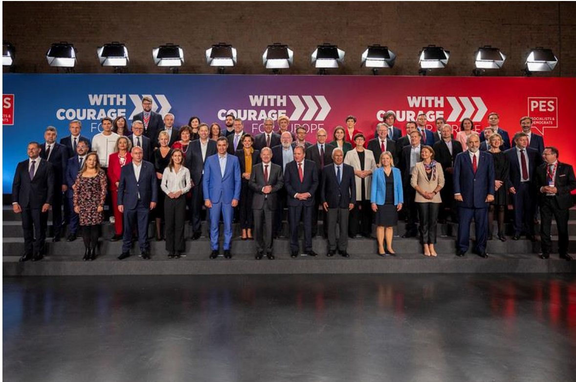
PES leaders at the PES Congress 2022 in Berlin in October.

building networks with PES representatives in the European Commission and the Council of the European Union.