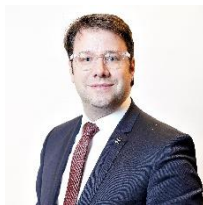
Chair of the CoR-UK Contact Group: Loïg Chesnais-Girard, President of Brittany Regional Council

The mandate of the CoR-UK Contact Group comes from the bureau of the Committee. The CoR-UK Contact Group has a mandate to meet twice a year (possibly three times). The European Committee of the Regions delegation comprises 13 full members, selected with a view to ensuring a political, geographical and gender balance. Full members may be replaced by alternate members. The Committee's members are listed here . The UK representatives at meetings of the CoR-UK Contact Group are selected according to agreements between local government bodies and the UK's devolved parliaments, assemblies and governments.